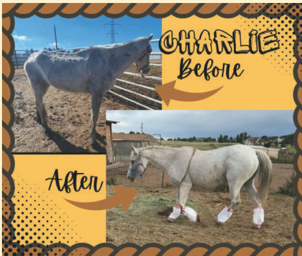
Above: Sweet but very naughty boy Charlie has captured our hearts!

While he's cooperative with basic care like handling his feet, he'll need proper training before he's ready for adoption. He's also making strides in learning to get along with other horses, and with patience and guidance, we're confident he'll continue to progress beautifully.