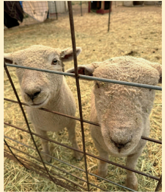
Above: Two sheep took refuge at FoLAS

"In times of crisis, communities rely on those willing to take action"