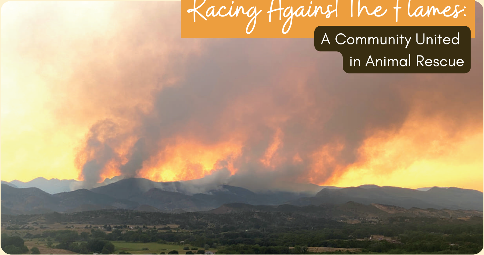
Above: Alexander Mountain Fire photo taken from Marianna Butte Golf Course

The Alexander Mountain Fire in Colorado led to widespread evacuations, affecting both people, domestic livestock and pets. Evacuation centers for animals were quickly established at Island Grove, The Ranch Events Complex, and NoCo Humane Society. As the situation came under control, many displaced animals were returned to The Ranch in Loveland, and some pets were reunited with their owners. However, the re-entry of livestock into certain areas was delayed due to safety risks.