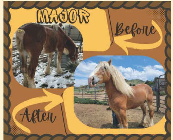
Above: Major (some may refer to as the Fabio of Horses due to his enormous size and luxurious locks!)

Some Major Updates Ahead! Major did fantastic during his surgery earlier this year and has acclimated well since. We learned he is a little over 17 hands tall and weighs ( only! ) 1,475 pounds. He is as sweet as can be to people but not so much to other equines, so he is currently learning to properly socialize with others. He is really happy at the new ranch as he has about 6x more space to run around than he did at our old place. Since coming to the new ranch and being able to stretch and run, he is feeling less symptoms of his neurological disorder which is called scratches . Once he is socializing well with other horses he may be an adoption candidate!